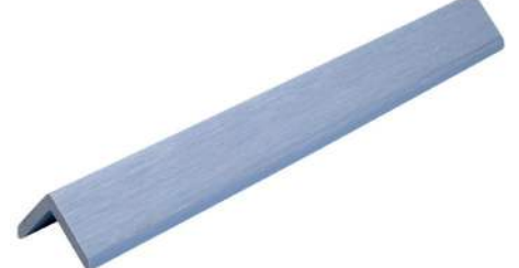
Deluxe & Slatted Corner Trim