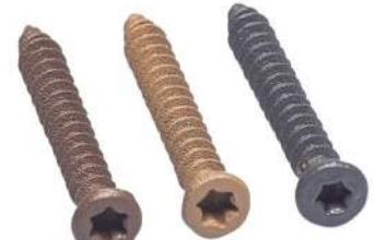
Coloured Trim Screws

Dimensions: 4mm x 35mm 100 units per box