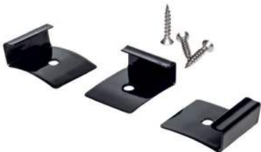
Starter Clip Set