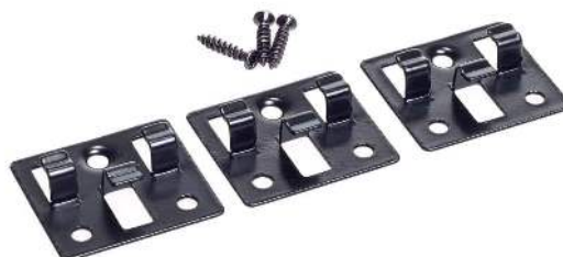
3mm Metal FastClip