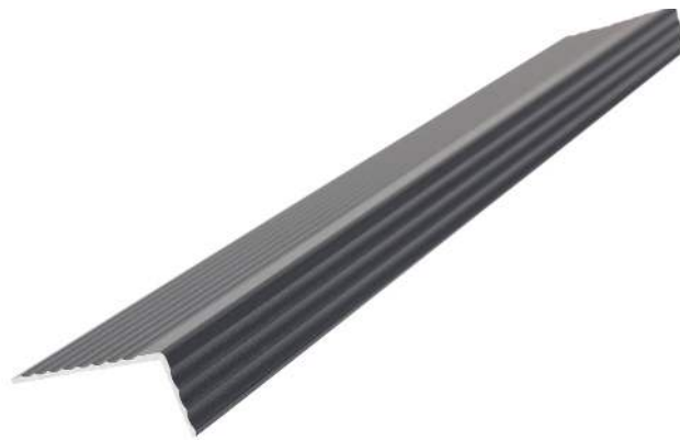
Aluminium Corner Trim